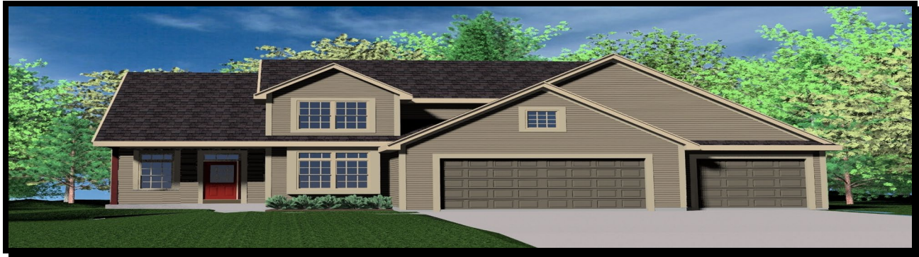
Picture is a rendering only; drawing is conceptual only ~ it varies slightly from actual home plan & exterior selections