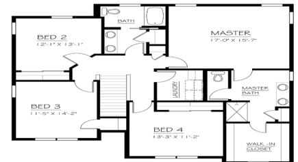
9014 MADISON II - SIGNATURE SERIES 1,422 SQ. FT. SECOND FLOOR AREA 02-25-2022 - JML

Kaerek Homes, Inc. 11600 W. LINCOLN AVE. WEST ALLIS, WI 53227-1018 PHONE: 414-321-5300 FAX: 414-321-8622 www.kaerekhomes.com